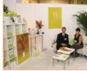
Skin 2 Skin

North America, and Skin 2 Skin™ Care was awarded the number three spot! Selected for its superior, cutting-edge formulas, Skin 2 Skin showcased the future of advanced, anti-aging skin care technology.